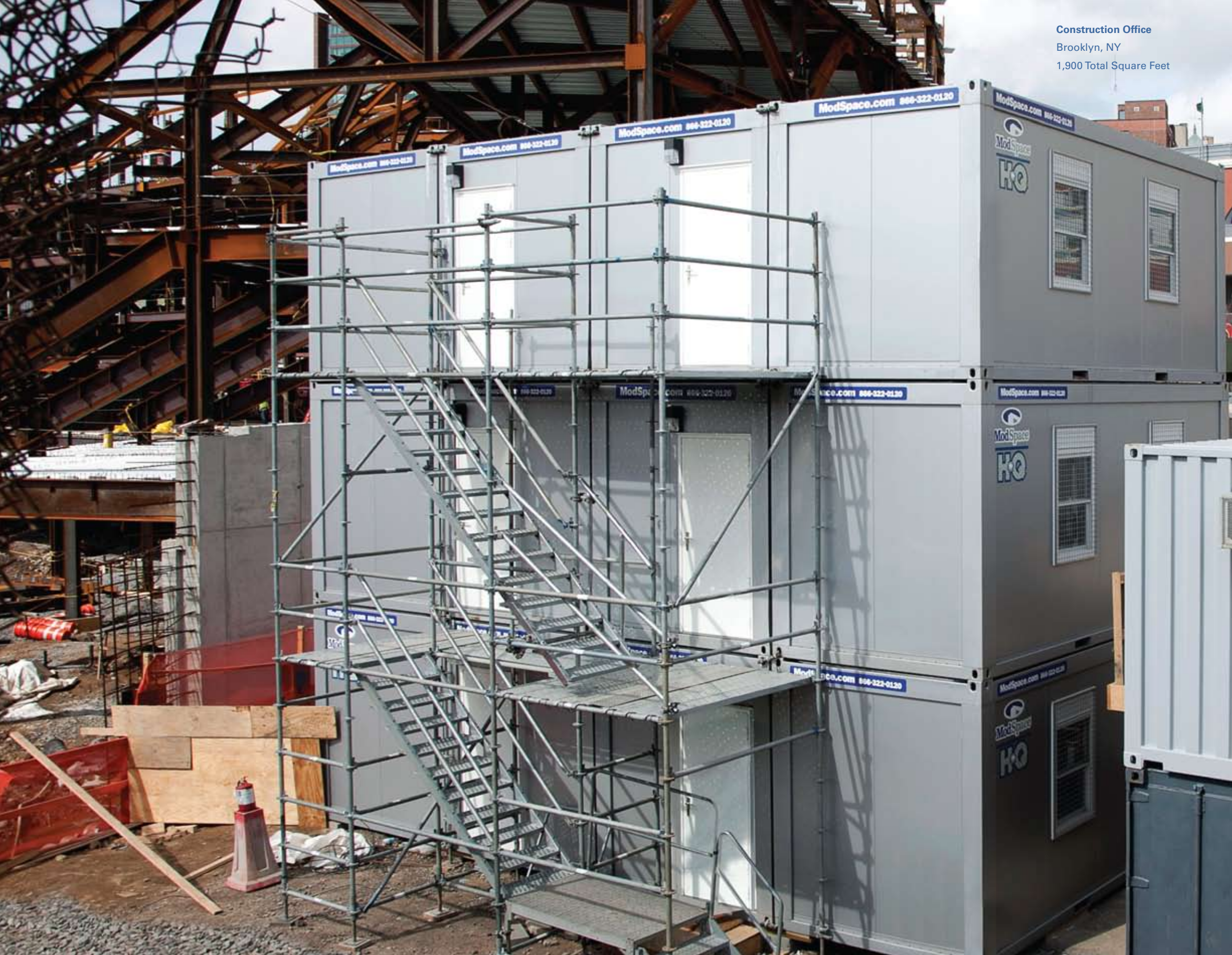
Construction Office Brooklyn, NY 1,900 Total Square Feet