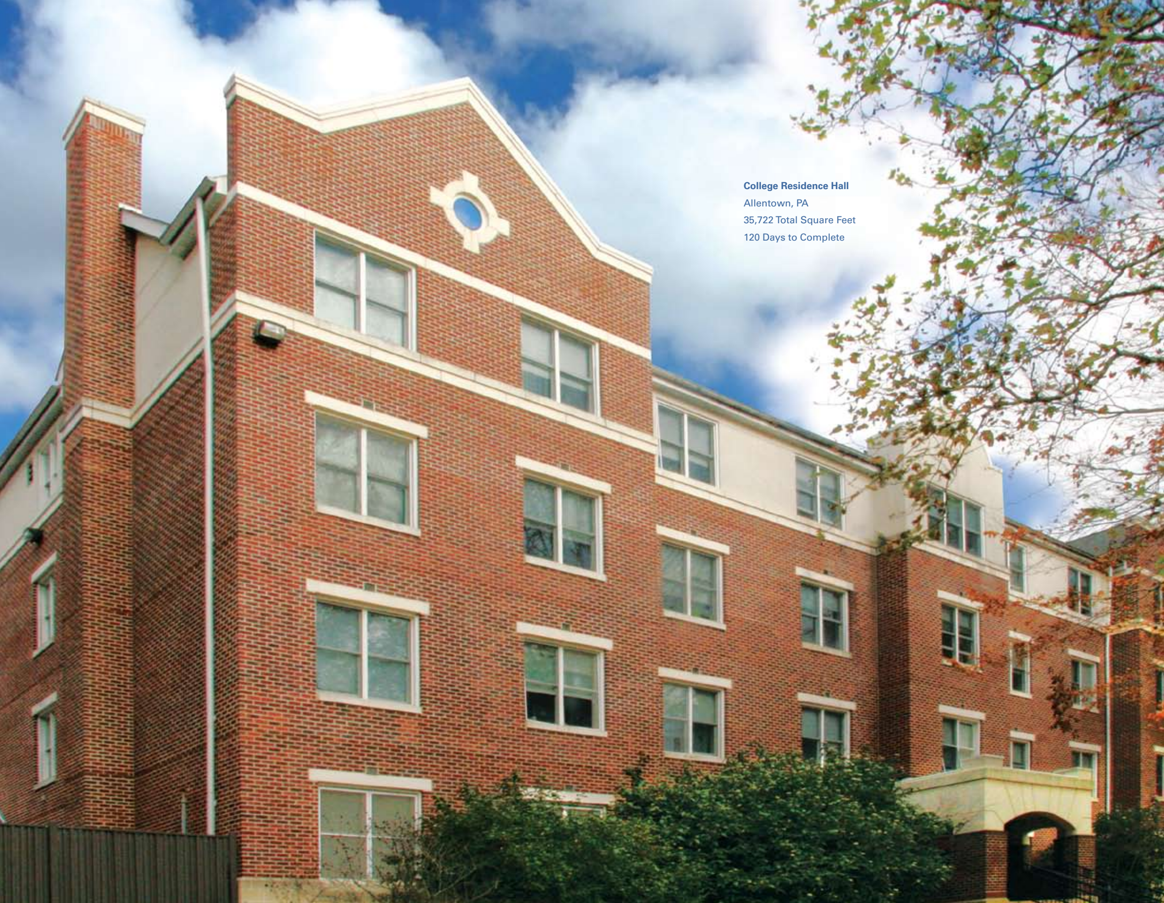
College Residence Hall Allentown, PA 35,722 Total Square Feet 120 Days to Complete