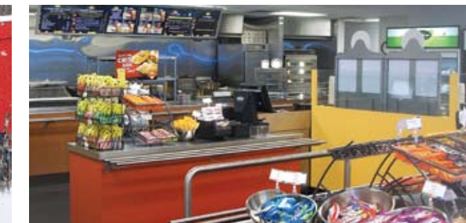
Ski Resort Cafeteria & Rest Area Bromont, QC 10,080 Total Square Feet 120 Days to Complete