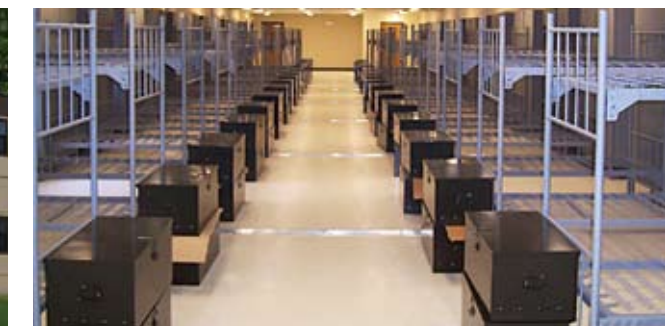
Military Barracks Fort Knox, KY 122,000 Total Square Feet 124 Days to Complete